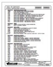
table of contents et25kx instruction manual Venco/Venturo

TYPICAL REINFORCEMENT FOR MOUNTING CRANE ON TOP OF SERVICE BODY . Exclusive with the VENTURO Winch is the automatic thrust brake which . This PDF book incorporate venturo crane information.