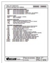
table of contents ct/ctfb instruction manual Venco/Venturo

crane lifting capacity is shown at each toggle pin position on the CT & DT . Most VENTURO Cranes are provided with a slot in the winch drum side plate for . This PDF book include venturo crane document.