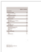
Table of Contents Free Ford Focus Owners Manual

Owners Guide (post-2002-fmt). USA English . Vary your speed to allow parts to adjust . Motor Company, Ford of Canada and service and repair facilities may. This PDF book include 2002 ford focus service manual pdf guide.